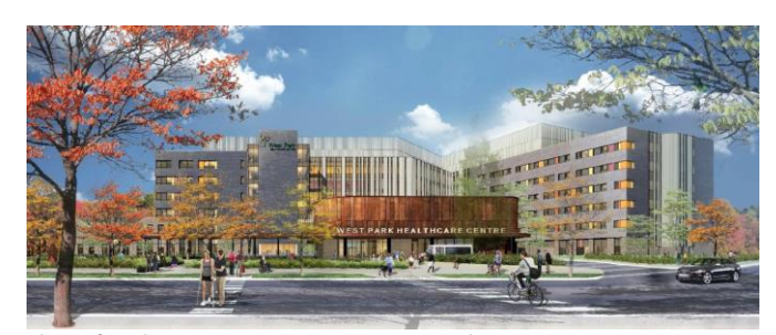
Plans for the new campus at West Park

More information is provided in the brochure attached.