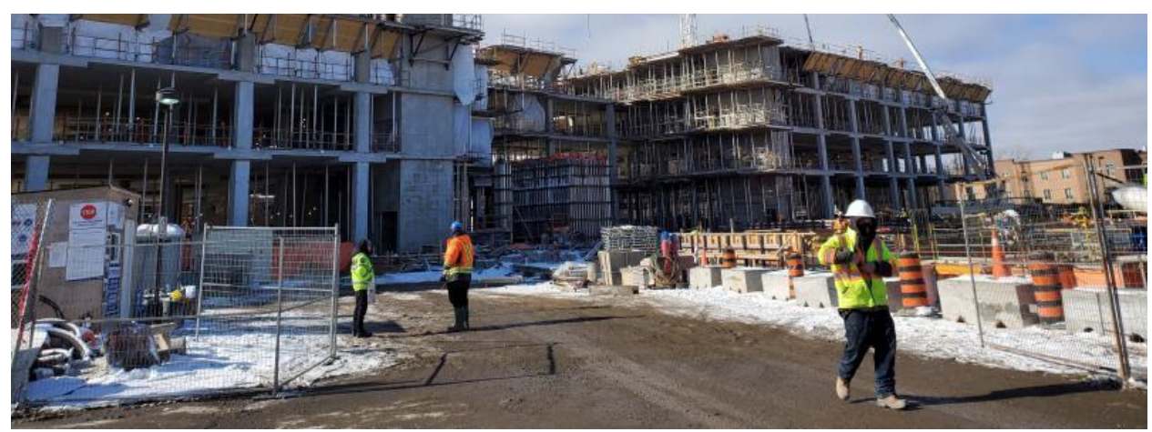
Current state at West Park Feb 2021

therapy pool with multi-sensory equipment, enhanced technology for virtual care and an impressive rehabilitation green space. They are currently pouring the concrete for the fifth of six floors, with plans to open in 2023. Stay tuned!